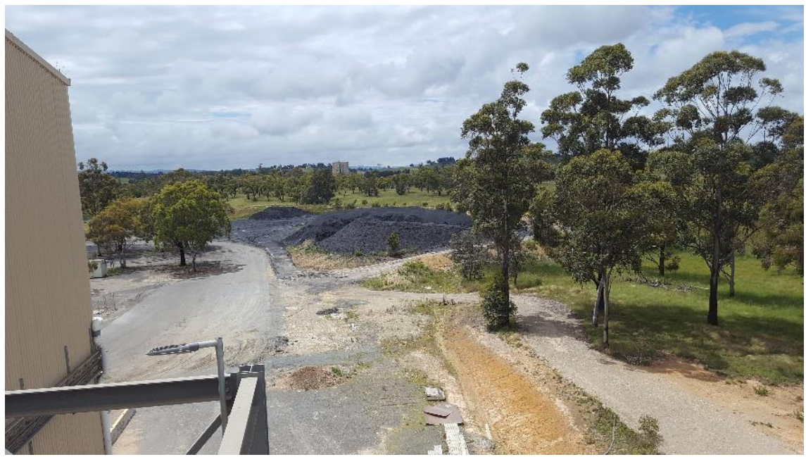
Plate 6 – Elevated View of area around receival shed

The inspection covered all sides of the receival shed and there was no visible dust leaving the facility. There were no signs of NSF spillage outside of the shed including the feed conveyor area, truck access areas, hardstand or surrounding landscaping.