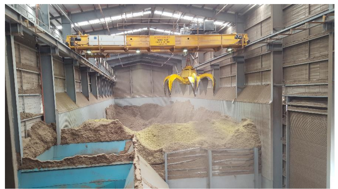
Plate 5 - Material Grab used to load conveyor system

A purpose built grab is used to pick up the material to deliver onto the feed conveyor. Some dust is generated during this process however the grab has a lockout which precents it working while the receival doors are open. This ensures that internal dust generated does not leave the building.