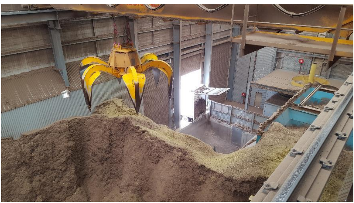
Plate 4 – Material Grab used to load conveyor system

A purpose built grab is used to pick up the material to deliver onto the feed conveyor. Some dust is generated during this process however the grab has a lockout which precents it working while the receival doors are open. This ensures that internal dust generated does not leave the building.