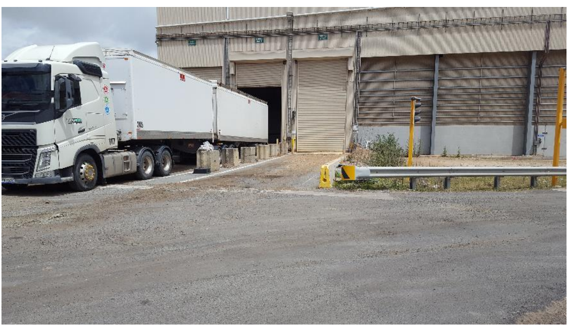
Plate 2 – Truck Receival