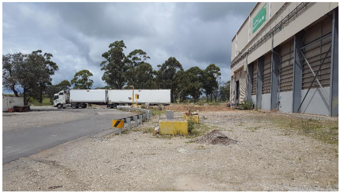
Plate 1 – NSF Truck Reversing into Receival Shed

The material is delivered by truck which reverses into the shed. NSF is then shaken into the receival bunker which is then "grabbed" by an overhead crane which can either reclaim the material into the main storage bunker or into the conveyor hopper. The material is weighed on the conveyor to control fuel dosage to the kiln. Data transferred to the control room includes conveyor speed and material weight which can be adjusted as required based on operating data from the kiln.