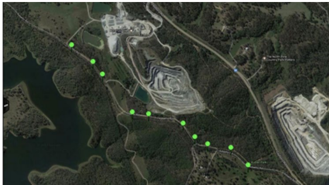
Photo 2: Koala Movement Fences, 10 Installed on Adsetts Road all allow for increased Koala Movement into and out of the site